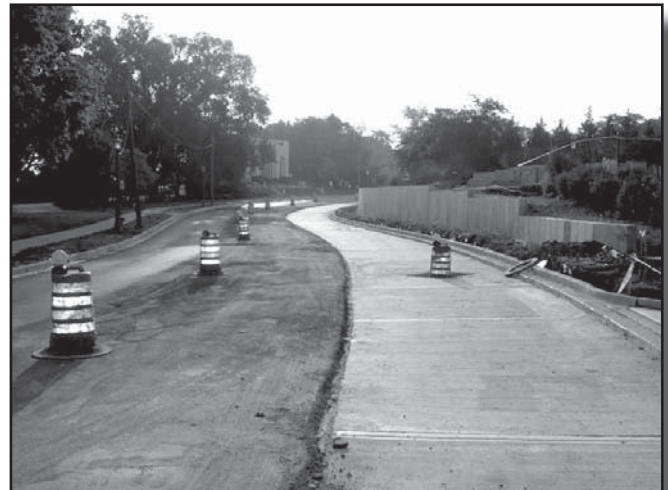
Newly reconstructed Sheridan Road looking south near the Baha'i House of Worship

When completed next summer, the new roadway configuration will consist of one travel lane in each direction, a two-way left turn center lane and outside bike lanes, new water and sewer main replacements, streetlight rewiring and streetscape enhancements. The project is largely funded through Federal and State grant funds.