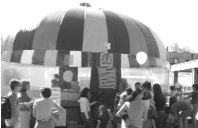
Fall Fest 2007 -- Kids with their parents are lined up for the ever popular Moon Bounce.

Free Pony rides, a Moon Bounce, face painting, balloon animals, and neighborhood camaraderie are all part of the fun planned for the 7th Annual Fall Fest on Ridge Road from 10 am to 1 pm. The Fall Fest is held in conjunction with the St. Joseph Parish Oktoberfest Market and Family Festival. The events provide a great opportunity for families to have some fun and to stop in each participating shop for food, treats, giveaways and more. For more information, call the Wilmette Chamber of Commerce at 847-251-3800 or visit www.wilmettechamber.org .