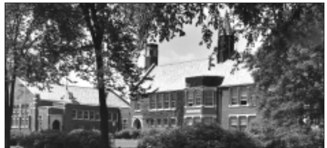
View of Howard School, which is featured in "Lost Wilmette," the current exhibit in the lower-level gallery of the Wilmette Historical Museum at 609 Ridge Road.