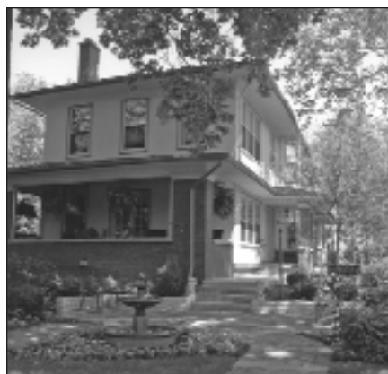
2008 Winner for Restoration, 1210 Greenwood Avenue

It's not too late to nominate your neighbor (or yourself) for a 2009 Wilmette Preservation Award! Properties must be nominated by Friday, September 19, 2008. Properties can be nominated for an award in one or more of the following categories: Preservation, Restoration, Sympathetic Addition or Eclectic New Construction. Nomination forms and more information are available at the Community Development Department at Village Hall, and online at www.wilmette.com .